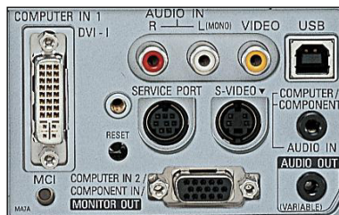
PLC-XU56/XU51 Terminal Input Panel

Warranty Three years parts and labor; 90 days lamp; Quick Repair Program under warranty Because its products are subject to continuous improvement, SANYO reserves the right to modify product design and specifications without notice and without incurring any obligations.