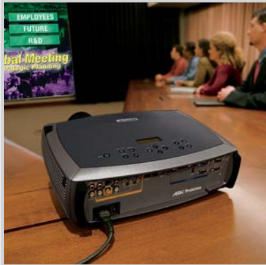
Connectivity for maximum collaboration.