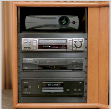
Unobtrusive in the meeting.